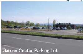
Garden Center Parking Lot