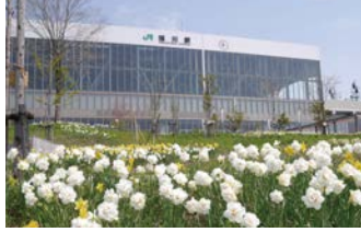
A popular location for taking pictures of flowers and of the Asahikawa Station. (Daffodils in the beginning of May)

Adjacent to the south exit of the Asahikawa Station. It is an area where many people come through on their way to work, school, or as a stop on their trip. You will see three flower beds each with their own unique theme. The "Riverbank Flowerbed" is composed of gorgeous flower cultivars, while the "Woodland Terrace" and "Waterway Meadow" flowerbeds are located close to the Chubetsu river and composed of wild plants that allow you to feel the presence of nature in Hokkaido.