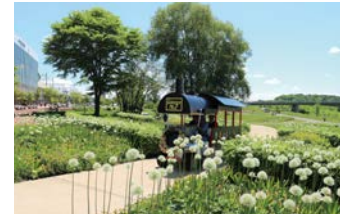
The Garden Train is in service from June to September on weekends.

This area is a favorite photo spot for photographers.