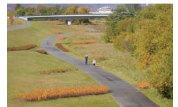
Autumn colors at the Grass Garden (End of September through October)

The best time to see the flowers and trees is between the latter half of July and August. We recommend taking a stroll through the Grass Garden not only during the summer, but also in the fall.