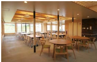
You can use the Garden Center as a rest area, and you are even able to reserve it for events.

The garden's main area contains the visitor parking lot and the Garden Center, which acts as a visitor center. This area is about a 7 minute walk from the Asahikawa Station. Here you will find flowerbeds with various themes: those composed of perennials grown in multicolored designs, those designated for edible herbs and vegetables, those with brilliant designs made up of annual flowers, and so on. Commemorate your trip to the garden by taking pictures at the garden's topiary displays, which are popular among guests.