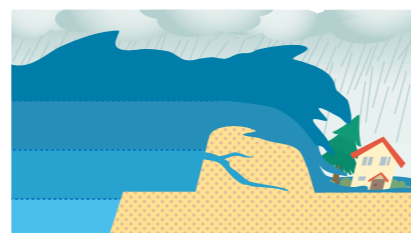
The damaged portion of the bank suddenly collapses under the force of the water, which rushes out and inundates the house.