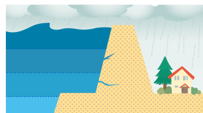
When the water level of the river rises to the height of the bank due to heavy rain, the bank starts to come under heavy pressure.

Flooding occurs when rivers rise as a result of heavy rain and cause the bank to collapse or overflow.